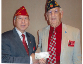
$1000.00 from Post 311 for Families of Servicemen