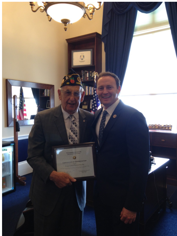
Certificates being presented to Congressman Ted Yoho and Congressman Patrick Murphy for their action against sale of illegal U.S. Military Medals.