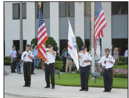
Post 286 Color Guard Universal Studios