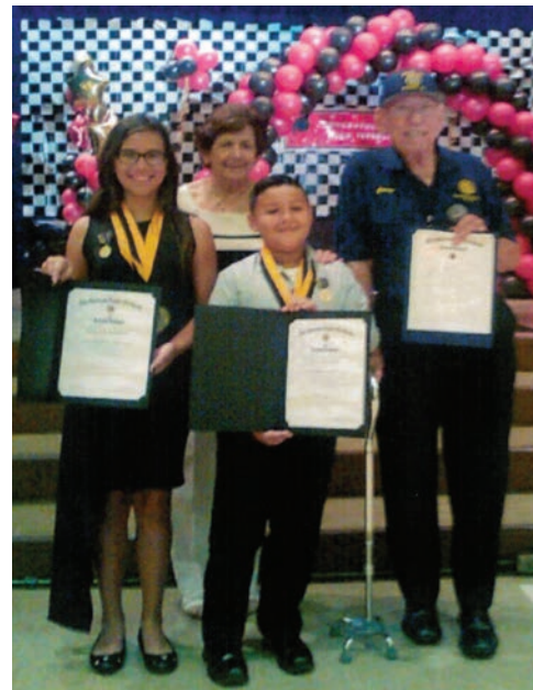
Amelia Earhart Elementary School American Legion School Award