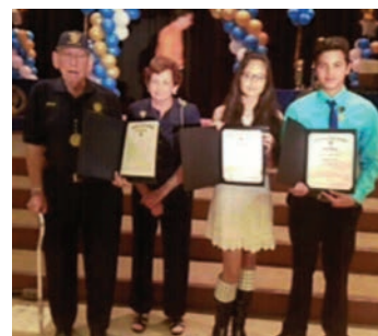
Hialeah Middle School American Legion School Award