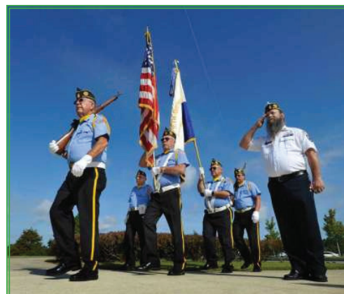
Members of the Color Guard from American Legion Post 137 march at the beginning of Saturday's ceremony to dedicate the American Legion Family Monument at the Jacksonville National Cemetery.