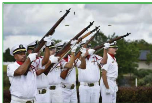
Members of the Beaches Honor Guard fire a gun salute during the dedication of the American Legion Family Monument Saturday.