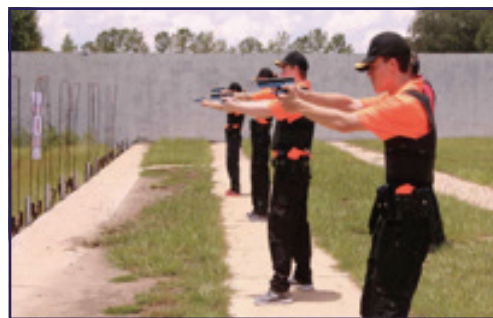
At the firing range

In the August edition of the Legion Link I gave you an overview of the initial program that occurred July 10-15, 2016. Nearly all of the young cadets that attended this year have already said they would like to do it again in 2017! I think that is testimony from the kids who experienced just how good this program is! Here are a few pictures of our cadets involved in their training.