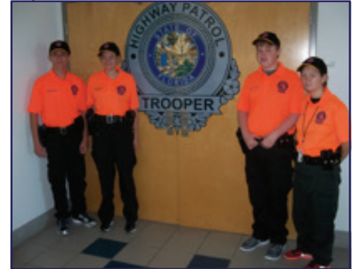
Cadets headed to class

for a week of training, room and board is $350/ cadet. Transportation to and from the Highway Patrol Academy in Havana is the responsibility of the parents or sponsoring Post. Other details will be provided at the Fall Conference in November.