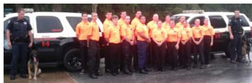
2017 Youth Law Cadets

I attended the Department Leadership conference in July, and served as a counselor at The American Legion/Florida Highway Patrol Youth Law Cadet Program, also in July. I am scheduled to provide some Central Area training in August and will also attend the National Convention in Reno, Nevada. Then in September I put on my hat as the Florida Legion College Chairman for another class.