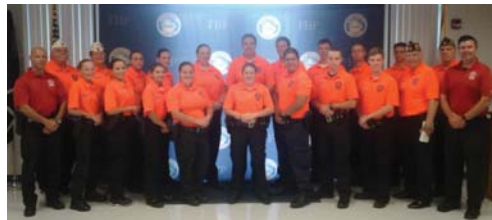
The American Legion/Florida Highway Patrol Youth Law Cadet Class Graduation Ceremony July 15, 2017

I do have the FHP proposed dates for the 2018 Youth Law Cadet program but I must clear that with the Department before the dates can be announced. I hope this program becomes a long-standing tradition between the Department of Florida and the Florida Highway Patrol. At the November 2017 Fall Conference, I plan to have the brochures for the 2018 program prepared to distribute, and I also plan to speak on this program. I have worn many hats all my years in The American Legion and I have never been more excited about a program as I am this program! A great opportunity for high school kids who may be thinking of a career in law enforcement. I will speak more on the program and provide some "cadet in training" photos in future Legion Link articles.