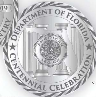
< BACK OF COIN