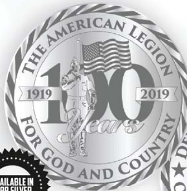
< FRONT OF COIN