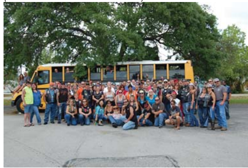
Legion Rider family of the 5th District poses during a break in the Boots on the Ground fundraiser ride.