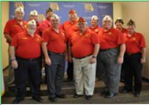
The Florida American Legion College 2017 Instructors