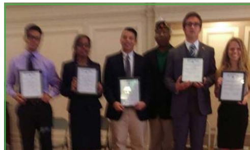
5th District Oratorical Contestants