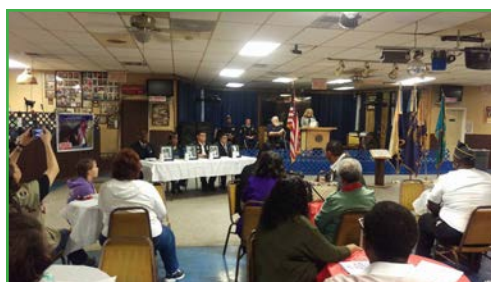
4 Chaplains Remembrance at Post 197