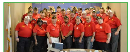
The Florida American Legion College Class of 2017

RESOLVED , That the dates for the next Florida American Legion College Class have been established as September 7-9, 2017.