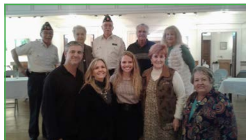
Post 54 Oratorical Winner and Family