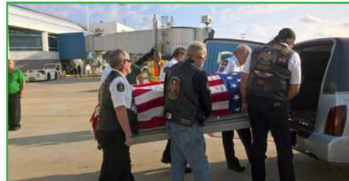
Soldier escort from Riders Chapter 88