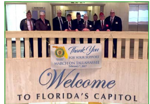
Many Thanks to all who supported the Florida Department's "March on Tallahassee"!

(American Legion Riders Chair - Continued) then we will head back up to Marathon and back to Homestead. We will stay in Homestead 2 nights for a loading/reloading break. Thursday, we will head out towards Okeechobee and wind around to Melbourne. Friday, we have some secret visits planned and possible a National Cemetery wreath laying before ending in Orange City. We will stay 2 nights in Orange City and make a loop up to the 5th District for some more great county roads before ending in Deland/Debra area. Registration is online and highly suggested.