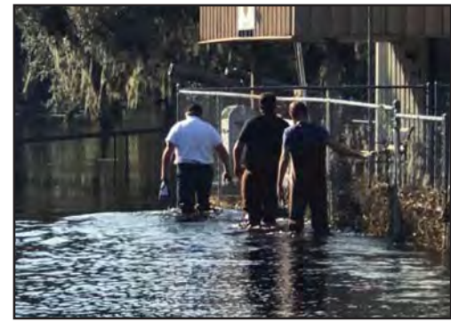
Arcadia Huricane Damage