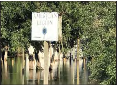
Arcadia Hurricane Damage