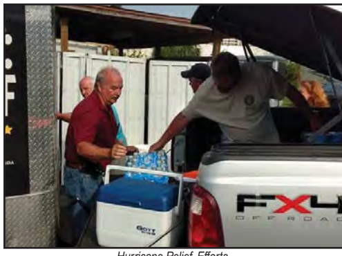
Hurricane Relief Efforts