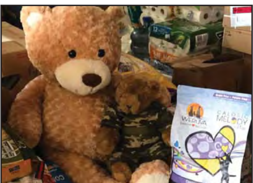
Shuga Bear and Friend