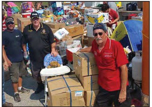
Hurricane Relief Efforts