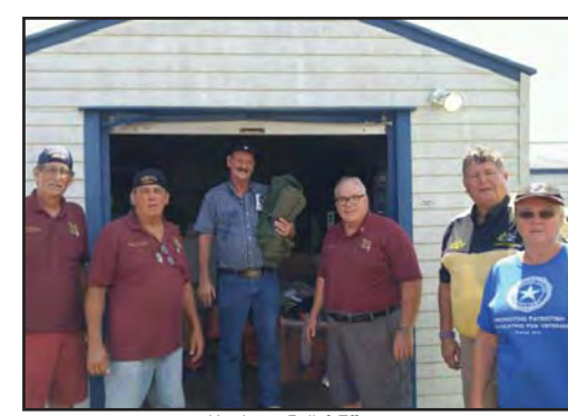
Hurricane Relief Efforts