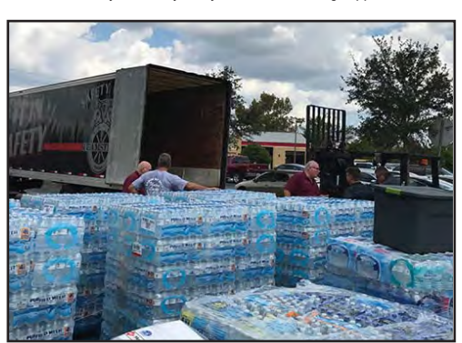
Hurricane Relief Efforts