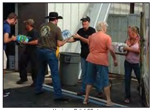
Hurricane Relief Efforts