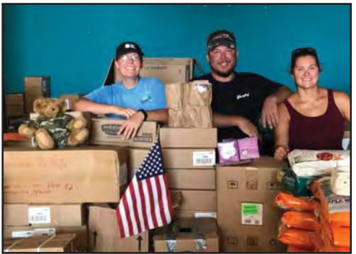
Homestead Hurricane Relief Efforts