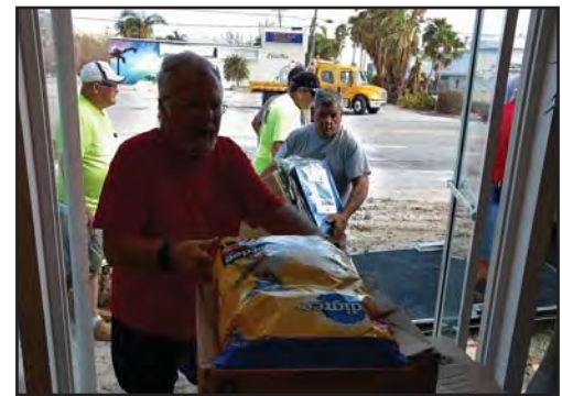
Hurricane Relief Efforts