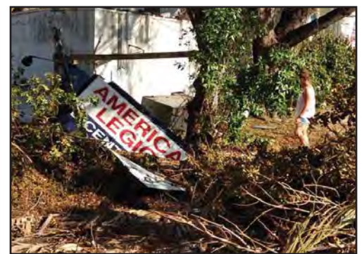
Key Largo Hurricane Damage