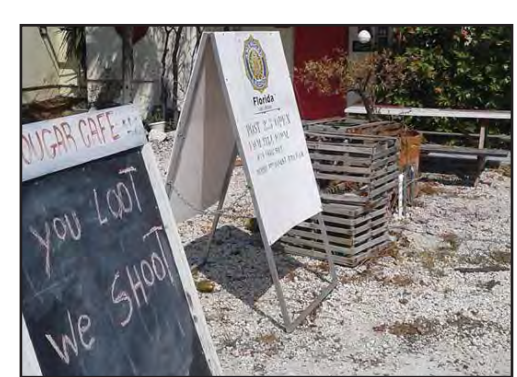
Key Largo Post 333