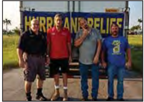
Delivering supplies from Maine.