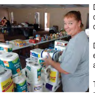
Department Legion and Auxiliary staff immediate disbursement.

Commanders to provide initial assessments of all Posts after the storm passed.