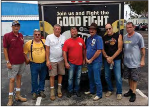
Hurricane Relief Efforts