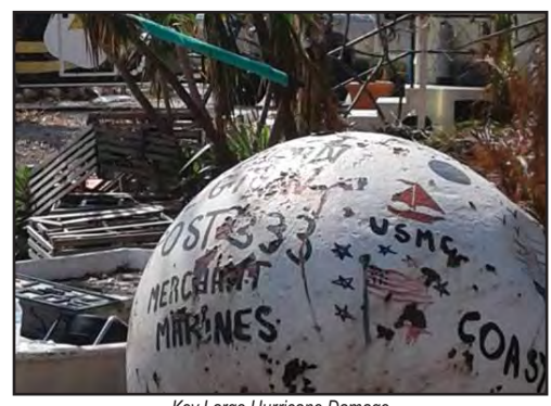
Key Largo Hurricane Damage