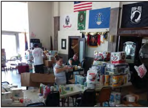
Homestead Hurricane Relief Efforts