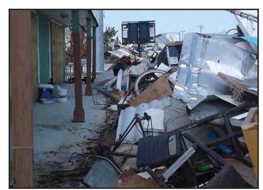
Marathon Hurricane Damage