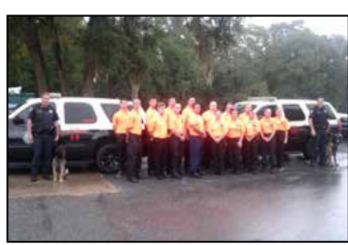
Youth Law Cadets