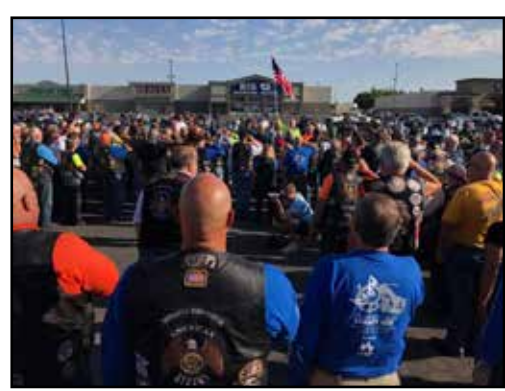
2017 National Legacy Ride to Reno, NV