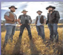
Scooter Brown Band