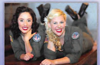
Letters From Home