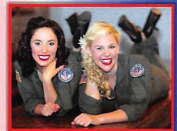
Letters From Home 6:45pm