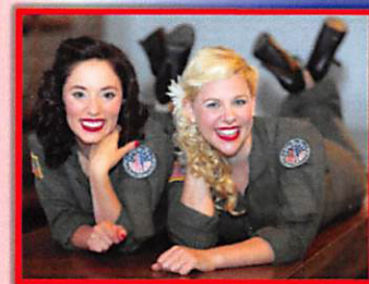
Letters From Home 6:45pm