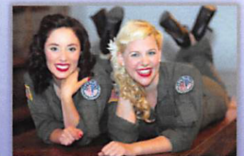
Letters From Home 6:45pm