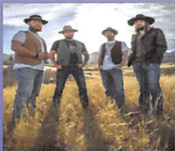
Scooter Brown Band 7:30pm