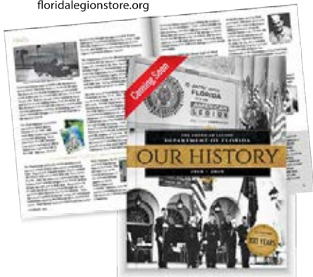
*Please note, this is a Florida Legion publication, and not the directory book sold previously.

PRE-ORDER MARCH 15 floridalegionstore.org