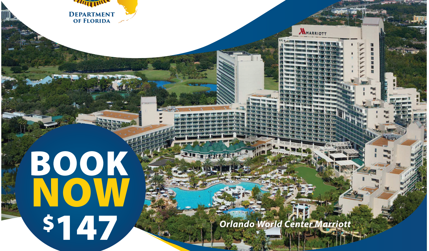
Orlando World Center Marriott