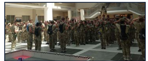
JCLC Summer Leadership Camp at NSU Broward County

Thank you all for the outstanding work you do to support our Youth Programs—an investment in our shared future. Wishing you all a very successful upcoming season!