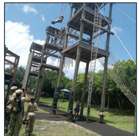
JCLC Summer Leadership Tigertail Recreation Center and Water Sports