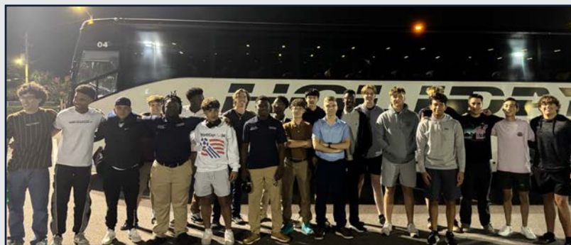
District 7 Headed to Tallahassee

Our 2025 Boys State session in Tallahassee was a tremendous success! A heartfelt thank you goes out to everyone who participated, volunteered, and supported this incredible program. Your dedication is what continues to make Boys State one of the premier youth leadership experiences in the country.