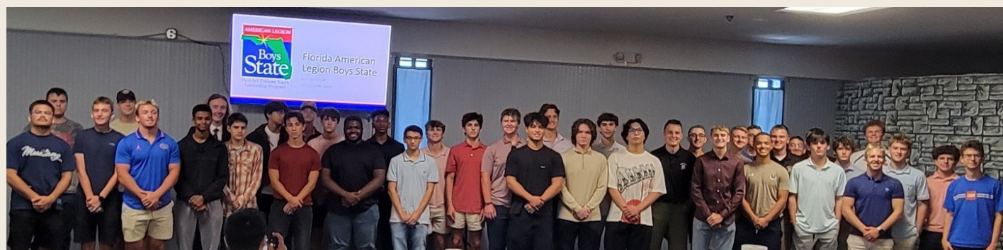
District 1 Boys State Orientation