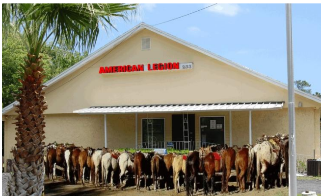
The Hitchin' Post, Cowboy Night, March 27th

560 N. Wilderness Trail ~ Ponte Vedra Bch, FL 32082