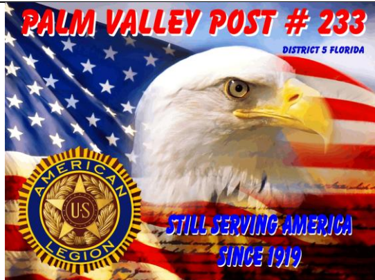
One of our T-shirt designs