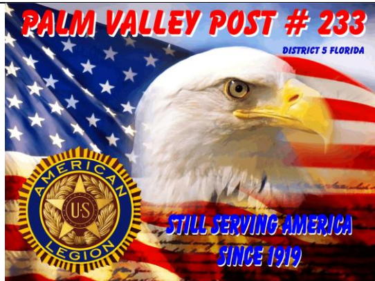
One of our T-shirt designs