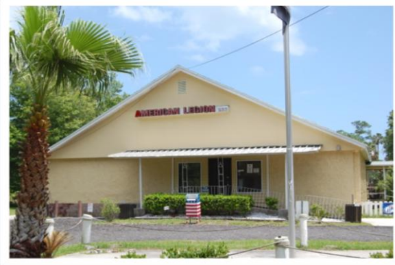
560 N. Wilderness Trail ~ Ponte Vedra Beach, FL 32082