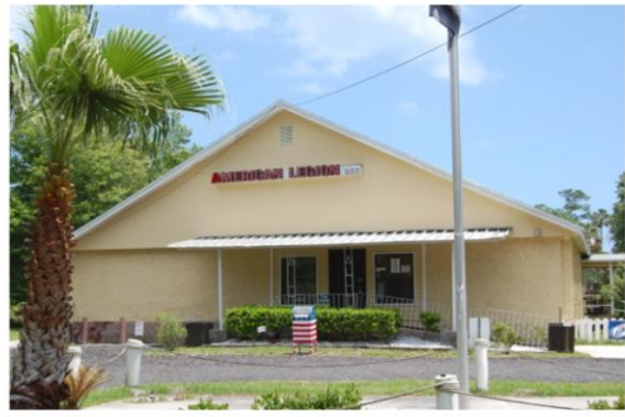
560 N. Wilderness Trail ~ Ponte Vedra Beach, FL 32082