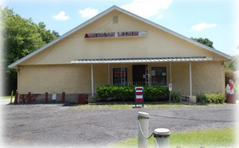
Our Post Home