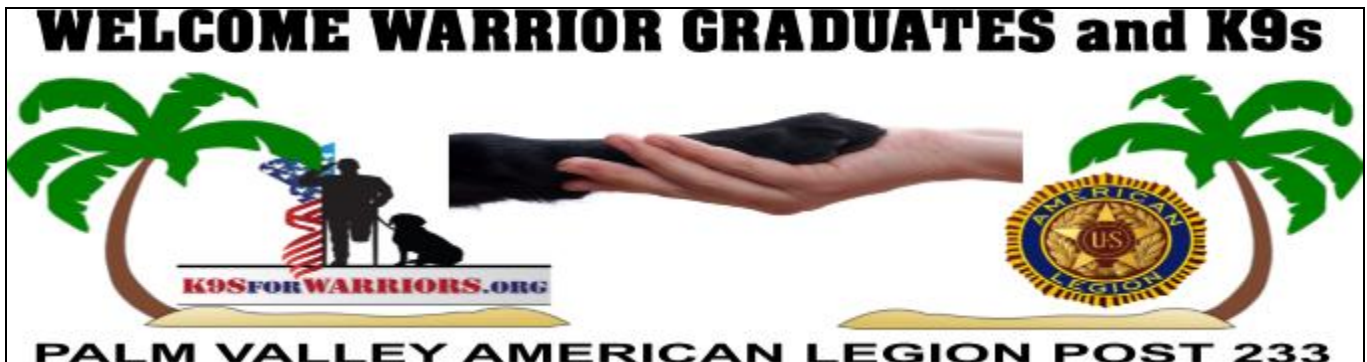
Our new 6' banner that will be displayed at all graduation ceremonies at the Post (it is in the July graduate picture, above)