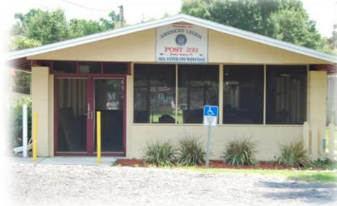
Commander Louis 'Pappy' Martin Pavilion

560 N. Wilderness Trail ~ Ponte Vedra Beach, FL 32082