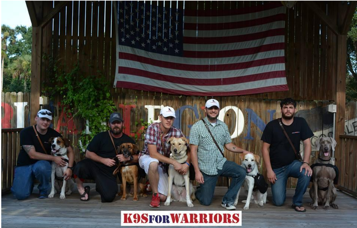
Thank you for your service and welcome home!