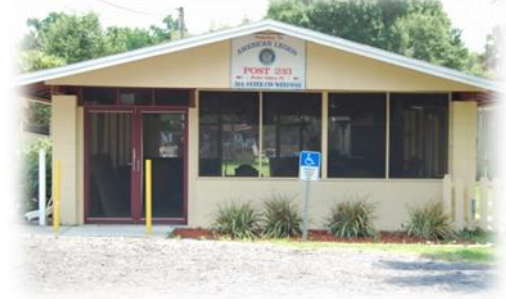
Commander Louis 'Pappy' Martin Pavilion

560 N. Wilderness Trail ~ Ponte Vedra Beach, FL 32082