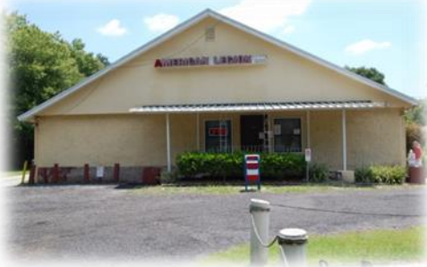
Our Post Home