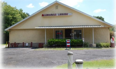
Our Post Home