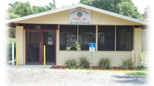
Commander Louis 'Pappy' Martin Pavilion