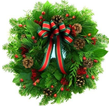
Our Post Home