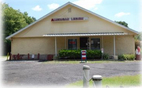
Our Post Home