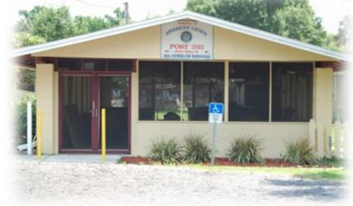
Commander Louis 'Pappy' Martin Pavilion

560 N. Wilderness Trail ~ Ponte Vedra Beach, FL 32082