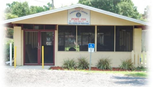
Commander Louis 'Pappy' Martin Pavilion