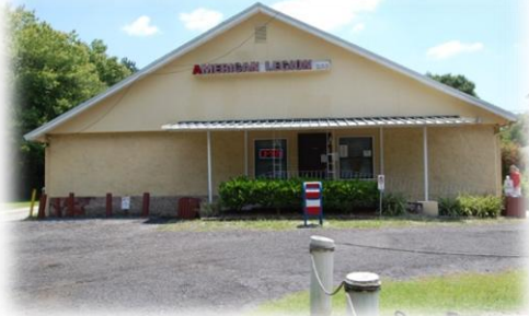
Our Post Home