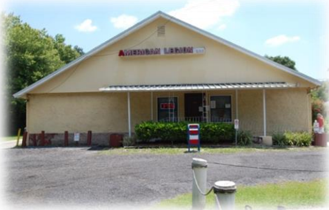
Ovr Post Home