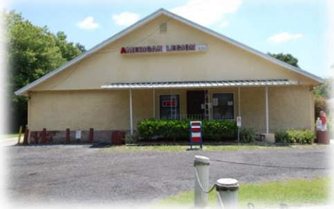
Our Post Home