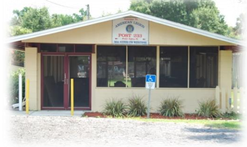
Commander Louis 'Pappy' Martin Pavilion